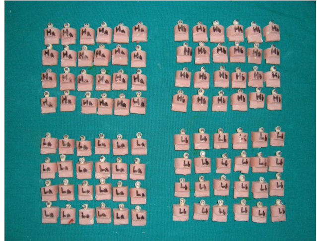
Figure 1 All samples of four experimental groups.

The data were processed and analyzed by using the SPSS software version 16.0 (SPSS Inc., Chicago, IL, USA). Data were then subjected to analysis of variance (ANOVA) to identify differences in various groups. Tukey's post hoc