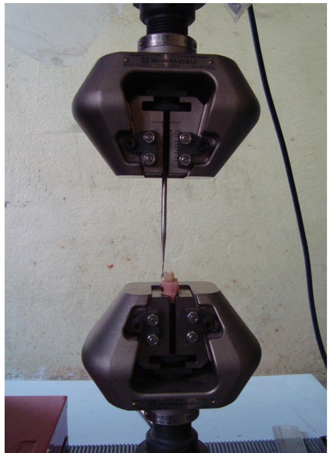
Figure 2 Close view of crosshead of universal testing machine with sample in situ.