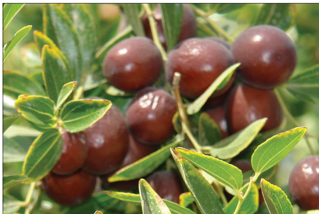
Figure 1: Z. jujuba in South Khorasan province, Birjand

and breast cancers have high incidence rates in all countries. Pancreatic cancer is also listed among the top five cancers in all countries except for China and Brazil. [10]