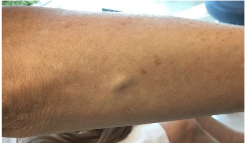
FIGURE 1: Clinical presentation

Freely mobile subcutaneous nodule on the right proximal dorsal forearm