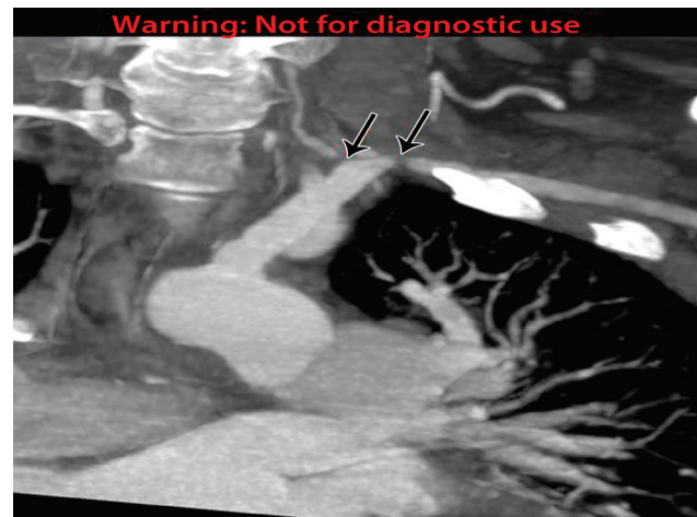
Figure 2 - Severe narrowing at the origin of left vertebral artery. Segmental stenosis of the left subclavian artery is noted.

Therapeutic intervention. Due to the fragile and inflamed vascular tissues, the planned aortic and mitral valve replacement surgery was postponed and immunosuppressive treatment initiated promptly. She was commenced on pulse therapy with 500 mg dose of methyl prednisolone daily for 3 days followed by 60 mg of oral prednisolone for 4 weeks. The dosage of prednisolone was tapered down by 5 mg weekly until reached the maintenance dose of 5 mg a day. She was also given regular low dose aspirin (81 mg).