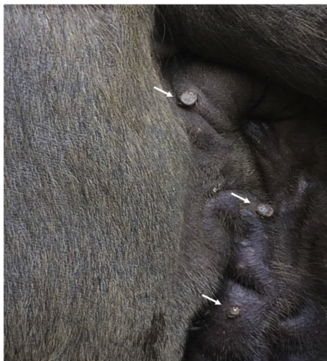
Fig. 1. Occurrence of Amblyomma mixtum in the perianal region of a water buffalo (adult stage).