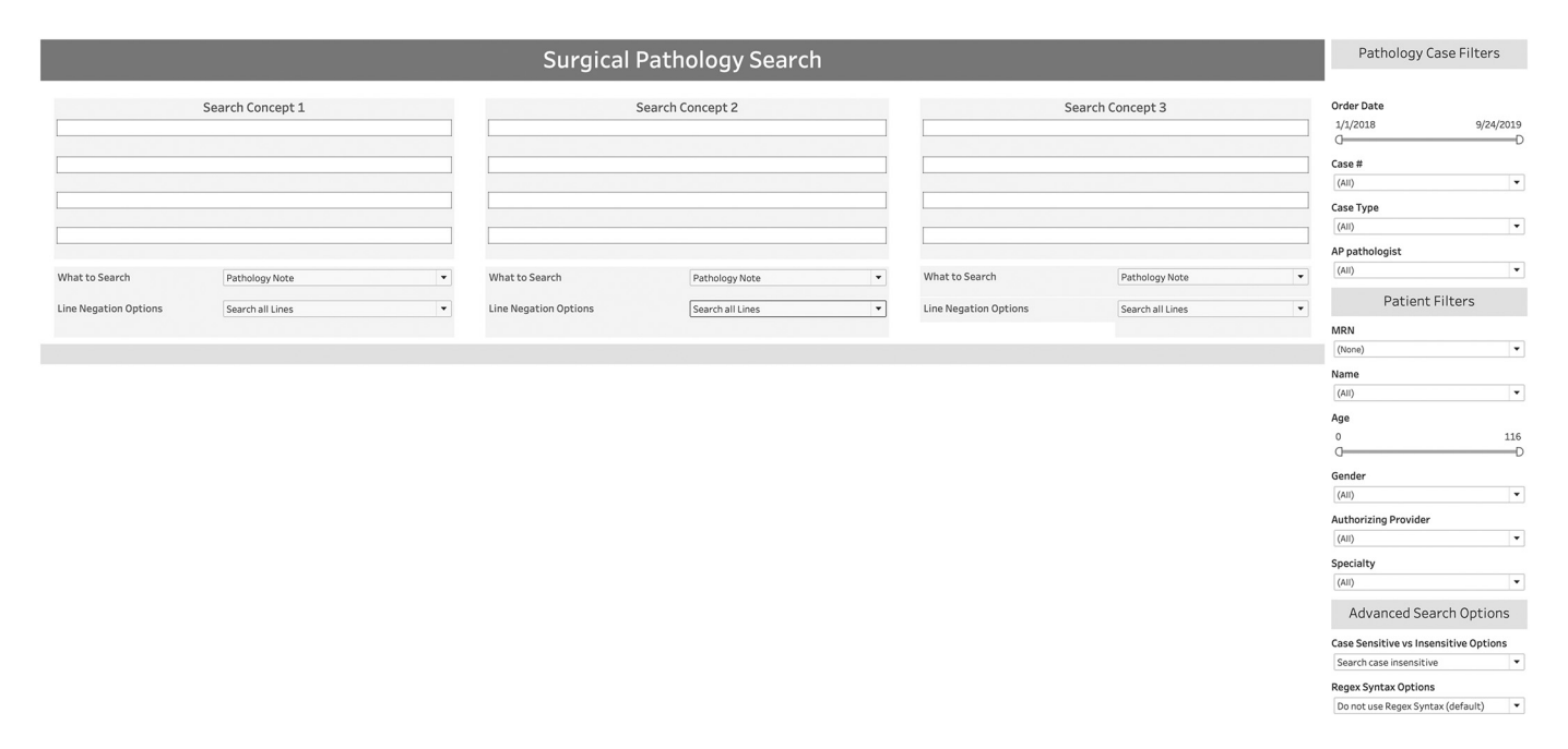
Figure 3. Screen grab of the anatomic pathology report search tool homepage as seen by a user with a tableau viewer license.

Regular expressions and negation are two sophisticated and challenging aspects of free-text search. The average pathologist is not able to understand or write a regular expression search. Our search tool users were taught to do simple free-text searches which have been sufficient for most use cases. There have been several users who have expressed the desire to learn how to write regular expression queries for increased complexity and granularity of searches. In these situations, someone with technical