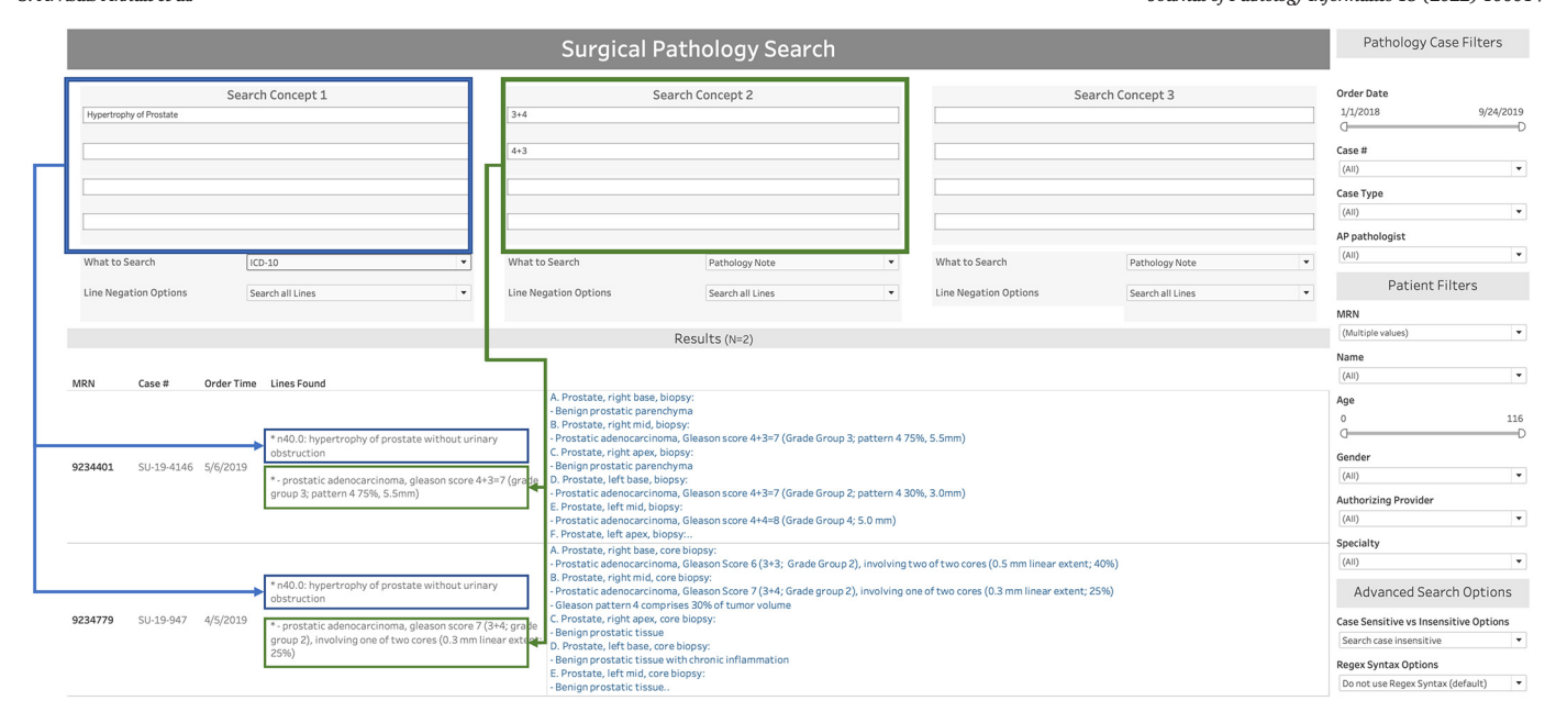
Figure 4. Screen grab of the anatomic pathology report search tool illustrating a query for the search concepts ICD-10 code "Hypertrophy of the prostate" and "3 + 4" or "4 + 3" on pathology notes using fake data with results displayed. Under "Results" the "Lines Found" column allows the user to see the exact lines where the search concepts were identified.