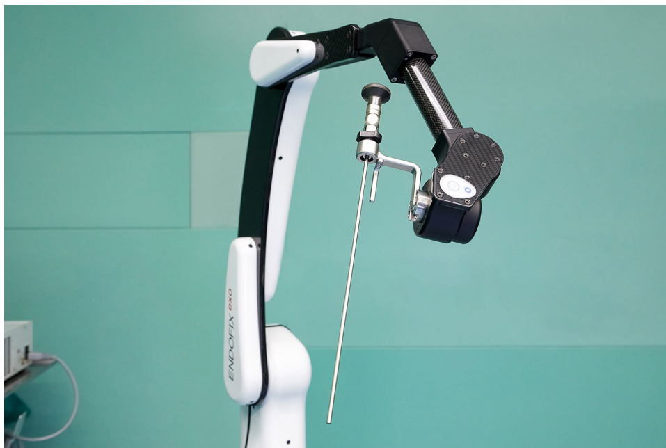
Fig. 1 The three electromagnetic locks of the ENDOFIXexo allow any position within arm range