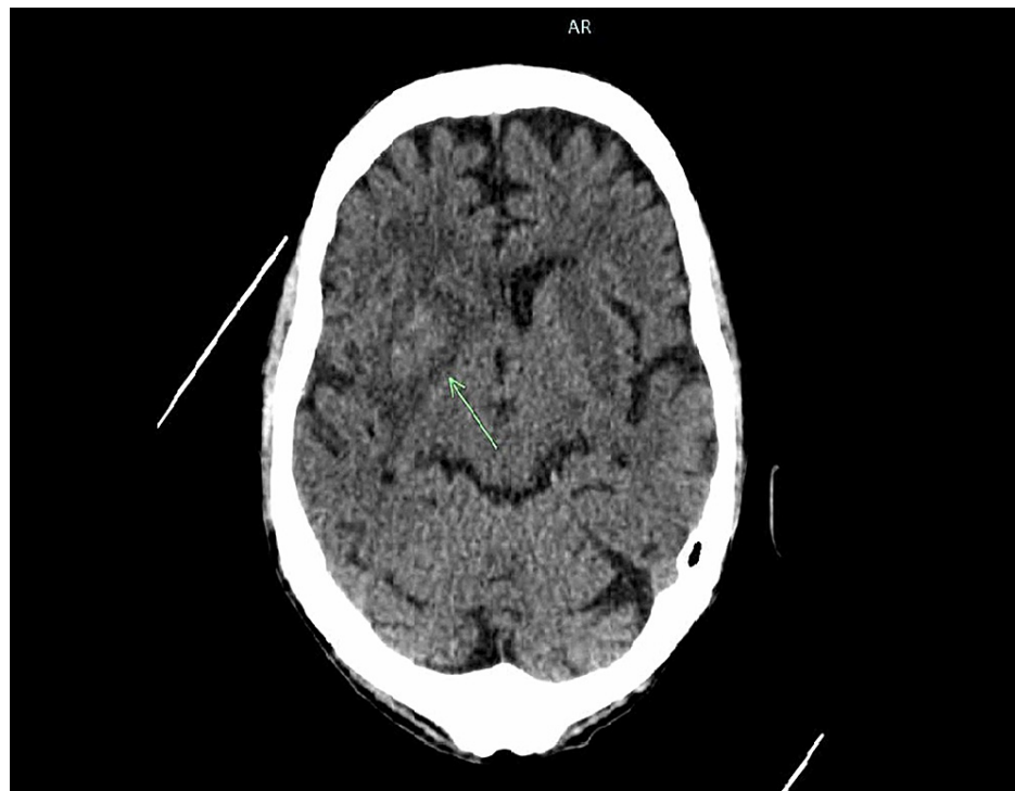
FIGURE 1: CT non-contrast

The arrow indicates an intraparenchymal hemorrhage in the right basal ganglia.