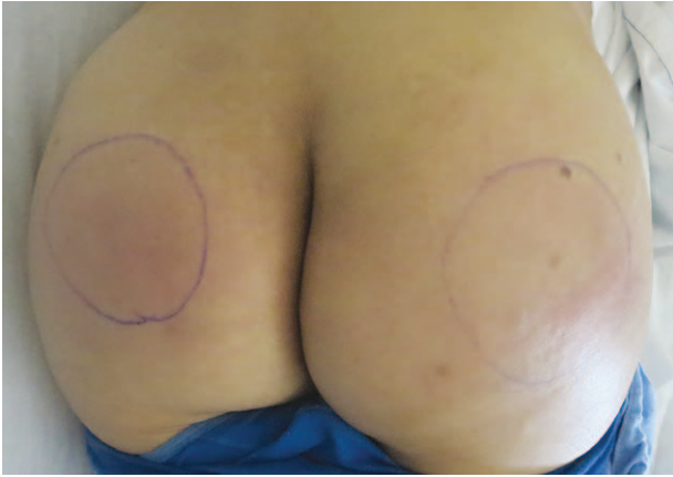
Fig. 1. Erythematous indurated lesions in bilateral buttocks 1 year after silicone injections for buttock augmentation.

procedure by phone, but they did not have a record of the substance injected. The patient had a temperature of 101.2°F, and laboratory results showed a leukocytosis of 12.2 thousands/microliter. Because of the concern about the possibility of infection (which we have seen commonly in similar patients), the patient was empirically started on vancomycin and ceftriaxone pending further studies. Magnetic resonance imaging was performed, which demonstrated extensive edema of the gluteal subcutaneous tissue, numerous nodular foci likely representing injected foreign material, consistent with silicone, and no discrete drainable fluid. To rule out the infection and accurately diagnose the injected substance, we performed a deep tissue biopsy. This was sent for Gram stain and bacterial, fungal, and mycobacterial cultures—all of which returned negative. Pathology was consistent with a silicone granulomatous reaction associated with patchy acute inflammation (Fig. 2).