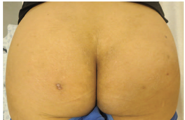
Fig. 3. Resolution of symptoms after completion of 3-week minocycline therapy. Scar on the right buttock is secondary to biopsy for pathology.

between repeated injections. 16 By using this technique, multiple authors have described satisfactory results. 16,17 However, complications have been reported. Injection of large volumes of silicone can result in tracking along tissue planes to distant sites. 17,18 Industrial or nonmedical silicone may be associated with high complication rates. 19,20 Inexperienced practitioners may also be more apt to inject less judiciously. Furthermore, it can be challenging to determine the technique and materials used when such procedures are performed in foreign countries and present in the United States with complications.