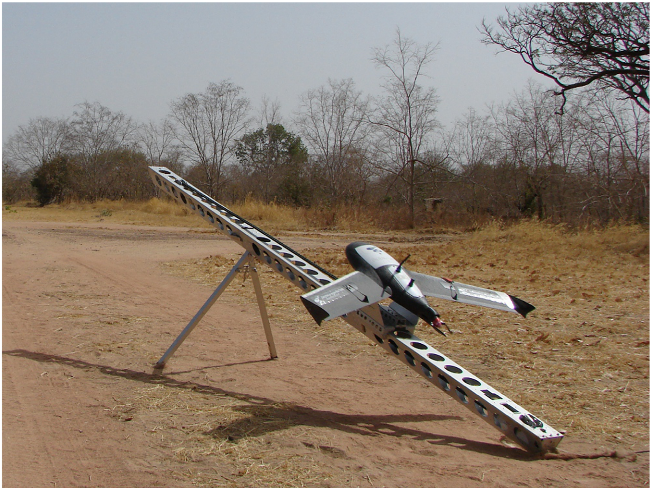
Figure 1. \times 100 on its launcher. doi:10.1371/journal.pone.0054700.g001