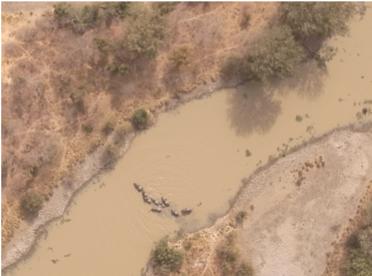
Figure 3. Aerial photo of elephants taken at a height of 300 m. doi:10.1371/journal.pone.0054700.g003

enumeration was easier from the aerial image. Elephants remained discernible up to an altitude of 300 m in his natural habitat (Figure 3).