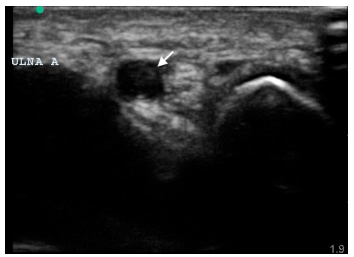
Figure 1. Ultrasound image of the distal ulnar artery in transverse plane noting echogenic thrombus (arrow) within the vessel lumen.

HHS is a rare syndrome of digital ischemia caused by damage to and thrombosis of the distal ulnar artery as it courses through Guyon's canal and around the hook of the hamate bone.<sup>3-4</sup> The damage to the artery typically results from recurrent blunt trauma to the hypothenar area of the hand. HHS predominantly occurs on the dominant hand of middle-age men.<sup>5</sup> Certain occupations pose a particular