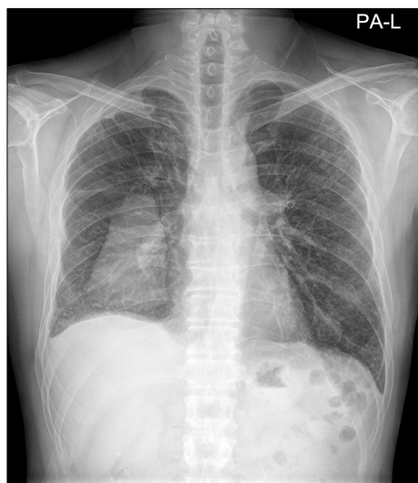
FIG. 3. Chest radiograph showing right loculated pleural effusion.

rosis with microscopic honeycomb change that was compatible with usual interstitial pneumonia. The results of nested polymerase chain reaction of Mycobacterium tuberculosis from the biopsied specimen and TB-specific interferon-gamma release assays were negative. Pulmonary tuberculosis was thus ruled out from the possible diagnoses, but we could not exclude the possibility of lung deterioration from the continuous use of etanercept. Clinically, we experience more patients with spontaneous pneumothorax owing to a lung manifestation of RA rather than etanercept-induced lung injury. After 1 week, when the patient's symptoms improved and the chest radiograph showed minimal residual pneumothorax, he was discharged without cessation of etanercept or methotrexate.