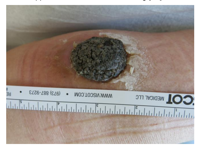
Figure 6: Irritated seborrheic keratosis resembling cutaneous squamous cell carcinoma

present. In clinical practice, it is important to separate irritated SK from cutaneous squamous cell carcinoma (SCC) (Figure 6). Immunohistochemistry may be helpful to distinguish both entities. In a recent study, combination of U3 small the nucleolar ribonucleoprotein protein IMP3 and B-cell lymphoma 2 regulatory protein (BCL-2) may has been shown diagnostic utility in distinguishing between irritated SK and SCC in daily clinical practice while epidermal growth factor receptor (EGFR) immunohistochemistry did not appear to be useful in this setting [12].