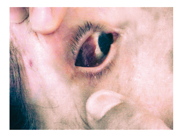
Fig. 1. Ocular B-cell lymphoma in a patient with chronic hepatitis C virus and Sjögren syndrome

Ramos-Casals M. et al: Liver disease in primary Sjögren syndrome