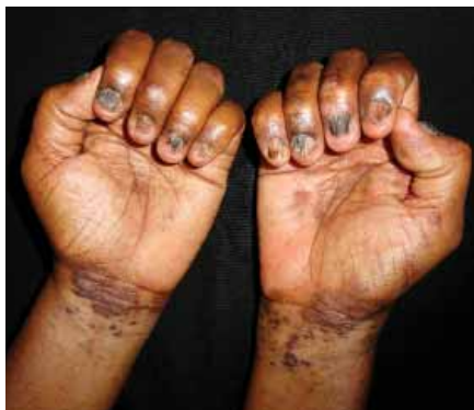
FIGURE 3: Dorsal pterygium, melanonychia, onychorexis, onychodystrophy on fingernails, hyperchromic, bright and polygonal papules on wrists