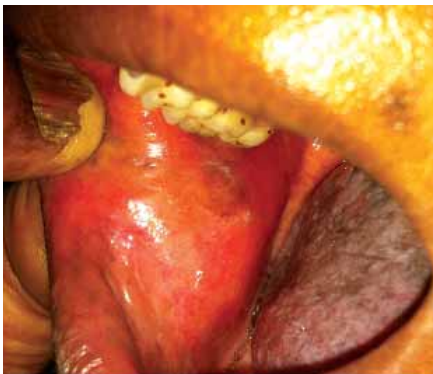
FIGURE 2: Bilateral white streaks of arboriform aspect in jugal mucosa