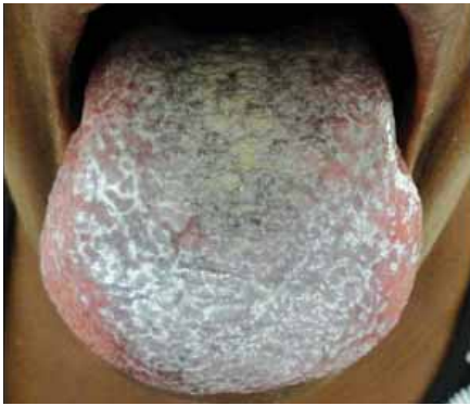
FIGURE 1: Thin white streaks of reticulate aspect on the dorsum of tongue