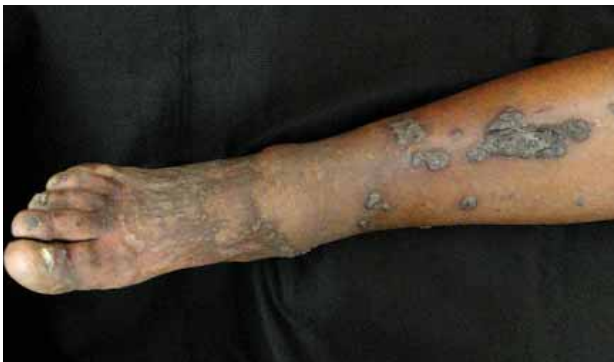
FIGURE 4: Papules and hypertrophic plaques with keratotic surface on left leg

During a review of 79 cases published in the literature about ELP a marked predilection for middle-aged women was noticed, affecting preferably patients with oral and/or vulvar LP, as well as the described case. Extraesophageal LP may be present in up to 99% of the patients, and it is more commonly found in the oral cavity (89%) and vulva (42%). The patient presented oral, but not genital LP. The most common symptoms are dysphagia (81%), odynophagia (24%) and weight loss (14%), the same ones reported by our patient. 3 Other symptoms that suggest the involvement of the esophagus include hoarseness, choking, and epigastric pain. Changes in the symptoms, such as epigastric pain and reflux to odynophagia, may