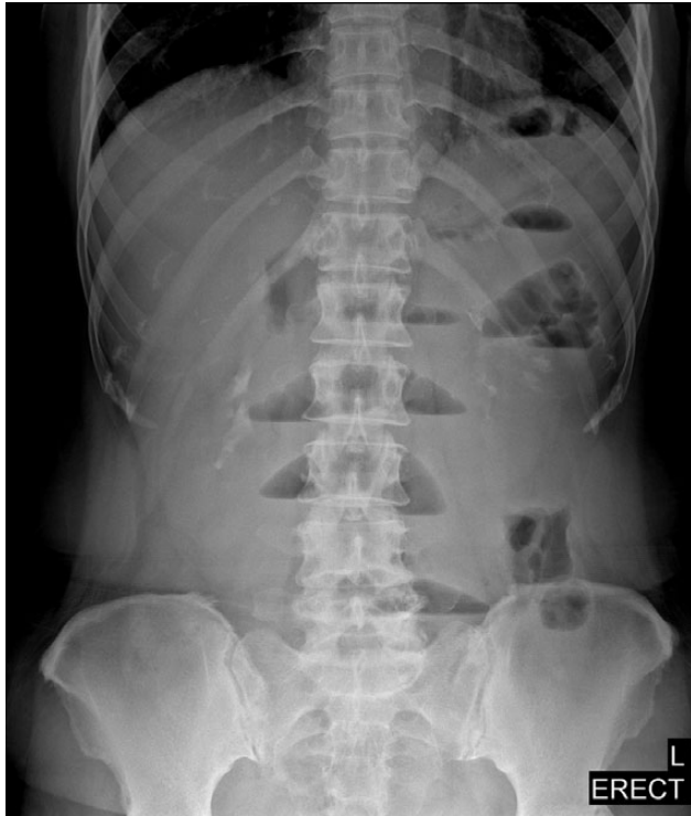
Figure 1: Upright abdominal radiograph showing multiple air-fluid levels, suggestive of possible distal bowel obstruction.

the defect and initially appeared congested but its colour and peristalsis improved rapidly. The hernia defect did not involve the medial aspect of the peritoneum on the sigmoid mesocolon and was confirmed no full-thickness defect. The defect was disappeared and changed to broad space easily from dissection of peritoneal attachment. There was no need to close the defect by intracoporeal suture laboriously. The operation was finished after confirmation of preventing recurrence. The postoperative course was uneventful and the patient was discharged 5 days postoperatively. The patient is free from recurrence.