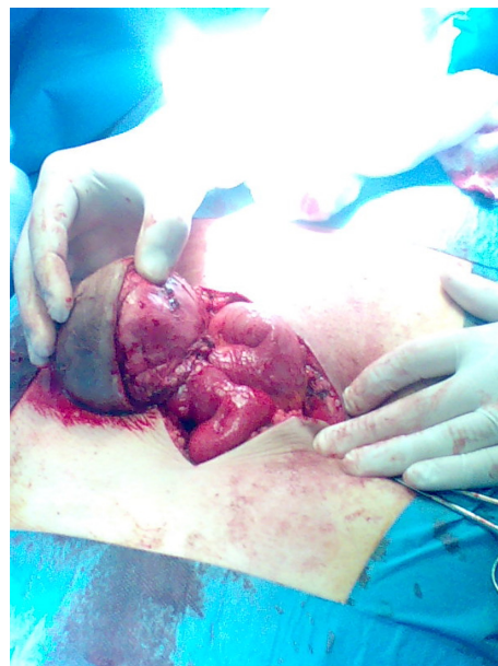
Figure 2. Hernia sac with incarcerated part of the antimesenteric small bowel wall.

CT examination of the abdomen. After written consent was obtained, patient was taken to the operating room.