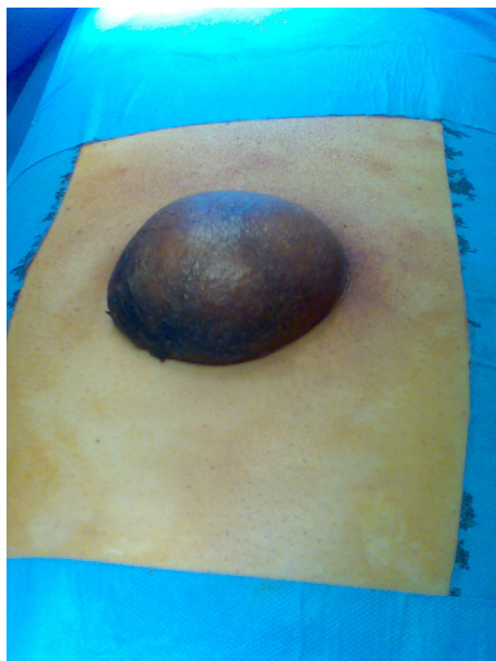
Figure 1. Periumphalic mass with the overlapping skin being discolored and ischemic. The umbilicus is eliminated.