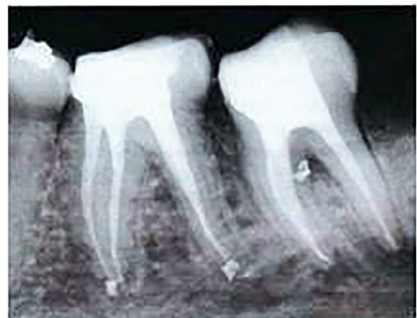
Fig. 3 Radiograph showing excess cement.