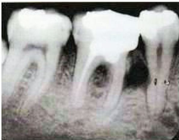
Fig. 2 Radiograph of one of the patients showing overhanging restoration.

The prevalence of sub-gingival restorations affecting periodontal health is listed in Table 1. The presence of such restorations was greater in males than in females, which can be attributed to the difference in the oral hygiene maintenance of the subjects. The occurrence of sub-gingival restorations was more prevalent in the age group of 35–45 years [Graph 1].