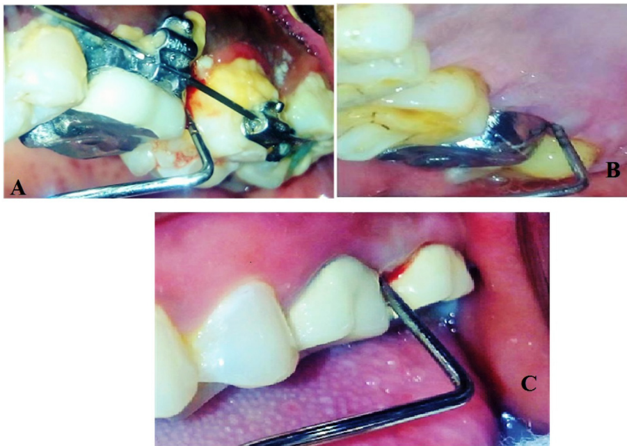
Fig. 1 (a) Measuring the probing depth in a patient with braces, (b) Measuring the probing depth in a patient who has metal crown, (c) the probing depth in patient with metal ceramic crown.