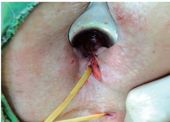
Fig. 5. The incised internal opening and the internal anal sphincter were repaired with interrupt suture at least two layers of absorbable suture material (4-0 Surgisorb). With this procedure, re-routing of the fistula through the intersphincteric plane was accomplished.

layers (Figs. 5 and 6). The seton was tied loosely for drainage (Fig. 7). For the fistulous abscess, drainage was performed via a radial stab incision made close to the anal verge. The rubber band was inserted through the incised wound to the IO, which allowed all necrotic debris to be removed. As mentioned previously for the case of a fistula only, under similar circumstances, a combined operation was added. The seton was knotted loosely for drainage. Anal packing was not used for all patients for their convenience.