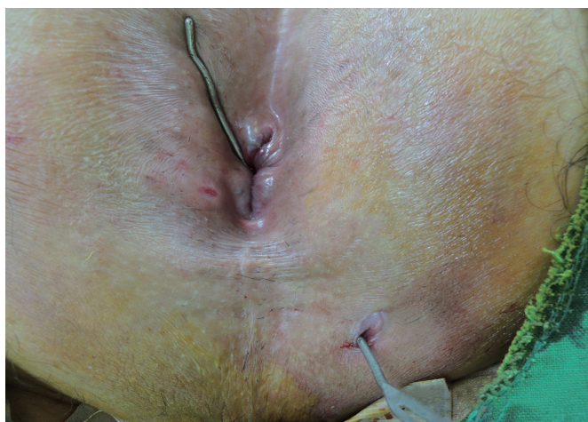
Fig. 1. A metallic probe was inserted gently from the external to the internal opening of the fistula. Meticulous care should be taken not to make an iatrogenic tract or opening because of forceful insertion.

Throughout this paper, a transsphincteric fistula means a transsphincteric-type fistula without an accompanying horseshoe extension. Additionally, a 'fistulous abscess' refers to anorectal sup-puration for which a fistula tract and IO were definitely found and