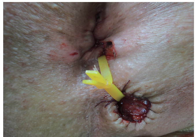
Fig. 7. Completion of the operation. The seton was tied loosely for drainage. The external opening of the fistula was marsialized with absorbable suture material.