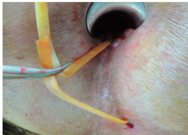
Fig. 3. A rubber band was inserted through the fistula tract as a seton. In this procedure, a 5-mm rubber band was used.

Under the saddle block with 0.5% bupivacaine, the patient was placed in a prone jack-knife position. Both buttocks were separated and fixed with adhesive tape for good operative field, and