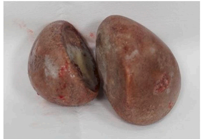
Fig. 3. Vaginal calculi.

Several cases of vaginal calculi have been previously studied but none have reported a case in a married adult woman complaining of infertility. 1,3,4 Our case shows that this disease can be less disturbing and silent for many years. Social, psychological, and knowledge factors may