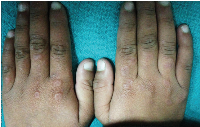
Figure 6: Perniosis - erythema multiforme like lesions

consensus criteria. [20] Out of the 18 cases, 16 were females and 2 were males. The gender-specific prevalence was 2.68% in females ( n = 16/598 ) and 0.33% in males ( n = 2/602 ) with a female to male ratio of 8:1, which was found to be statistically significant ( P -value = 0.0008).