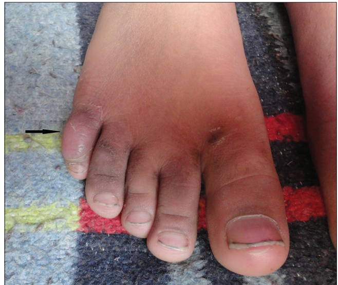
Figure 7: Superficial frostbite - waxy appearance of affected toe (black arrow)

only. Extremities such as the nose, tips of ears, and so on were not involved in any case.