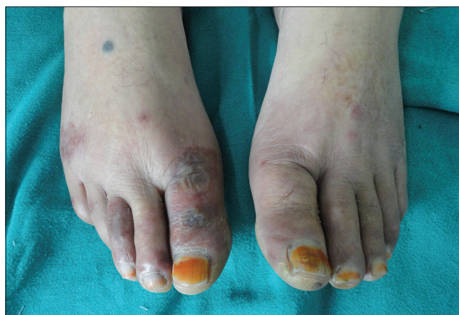
Figure 3: Perniosis - erythematous lesions with overlying flaccid bullae