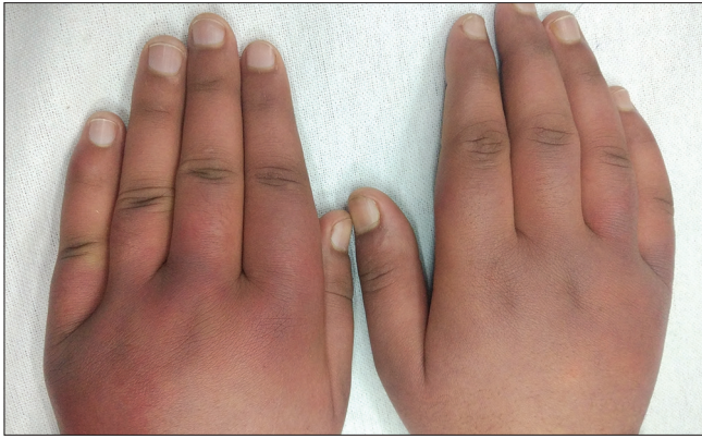
Figure 4: Perniosis - edema and cyanotic discoloration of hands