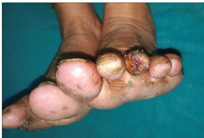
Figure 8: Deep frostbite - ulcerated lesions

was found to increase with age till the age of 70 years and then showed a dip in the 71–80 years age group [Table 5].