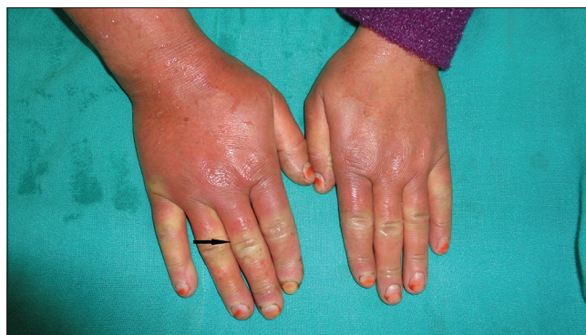
Figure 9: Raynaud's phenomenon – Cold-mediated vasoconstriction (black arrow)

Perniosis was the most common cold dermatoses we came across in this study. The prevalence of perniosis in our study (12.2%) was consistent with textbook citations which ranged from 7% to 12.2%. Singh et al. noted a prevalence of 5.7% which was significantly lower as compared to our study. [12] However, their study was conducted in a hospital setup and milder cases of perniosis were bound to be missed as they were less likely to attend the hospital for the same. Besides, their study period included all the seasons while our study was conducted exclusively during the winter season. This explains the higher incidence of perniosis in our study. Only a few studies have been conducted on this topic in tropical countries. Al-Nuaimy et al. studied perniosis in Iraq and reported that perniosis