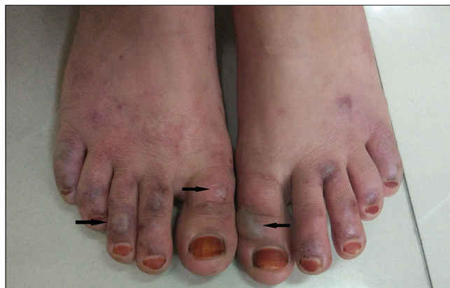
Figure 1: Perniosis - bullous lesions (black arrow)

The prevalence of Raynaud’s phenomenon was documented as 1.5% (95% CI, 0.9–2.4%, n = 18/1200) when the history of cold digits along with biphasic/triphasic discoloration was invoked as inclusion criteria and this was taken as the measure of prevalence in accordance with international