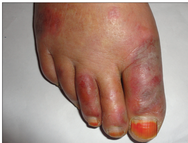
Figure 2: Perniosis presenting as erythematous cyanotic swelling