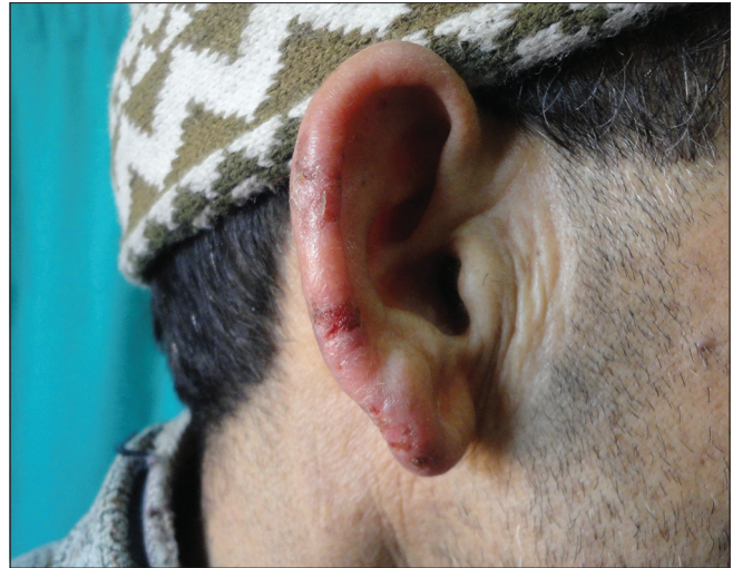
Figure 5: Perniosis - ear involvement

Patients reported affliction of all fingers and never as an isolated phenomenon in one or two fingers. The disorder predominantly affected the fingers in all patients [Figure 9] and additional involvement of toes was seen in 4 cases