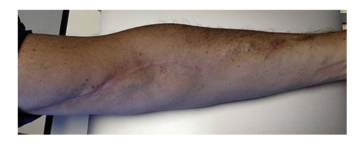
Fig. 3. Six-month control.

Salerno et al.: Giant Brachial Aneurysm after Arteriovenous Fistula Ligation