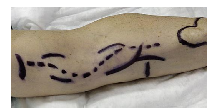
Fig. 1. Perioperative mapping.