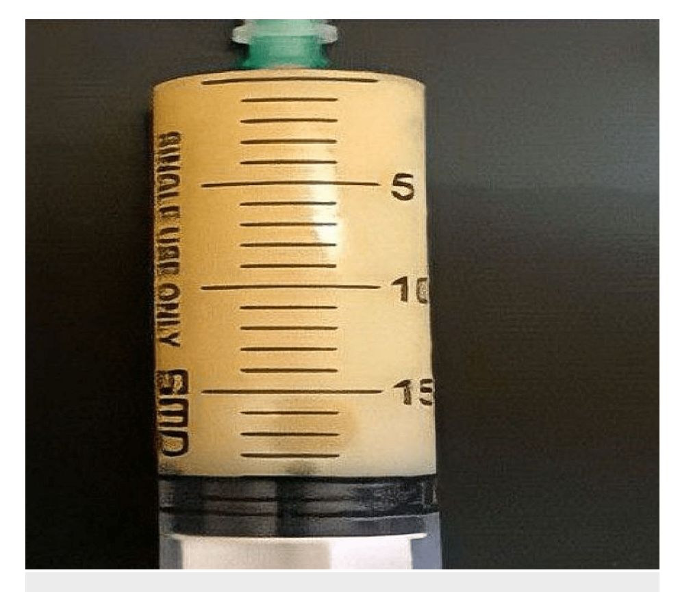
FIGURE 2: Pleural fluid drained from the right side: milky appearance suggests chylous effusion.

Blood tests were normal. Chest X-ray (CXR) revealed bilateral pleural effusion and interstitial infiltrations. Rhinosinuses CT-scan showed increased maxillary sinuses mucous membranous thickness. Chest CT scan showed bilateral pleural effusion more significant on the right side and interlobular thickenings in the lung bases. Echocardiography was normal. Right side thoracentesis demonstrated chylous effusion (Figure 2, Table 1).