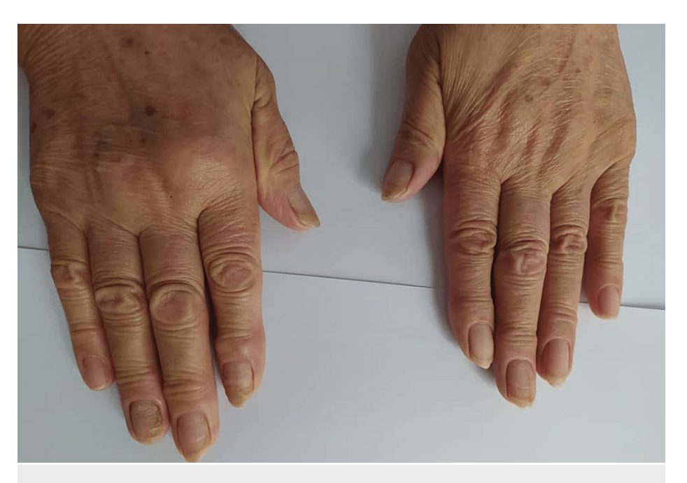
FIGURE 3: Improvement in the nail color after two years of Amlodipine cessation.

Nail growth was slow in comparison to normal individuals (0.1-0.25 mm per week in yellow nail syndrome versus 0.5-2 mm per week in normal population).