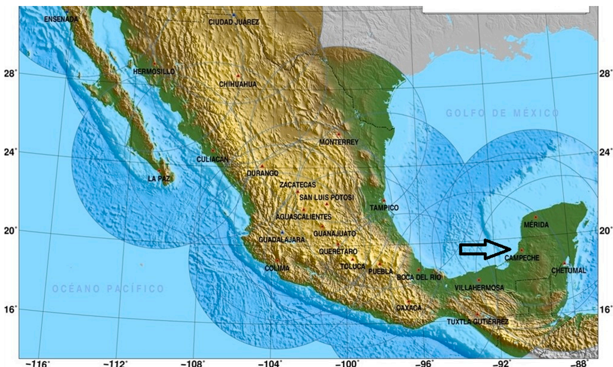
Fig. 1. Map of Mexico: arrow indicate Campeche state in the Yucatan peninsula in the gulf of Mexico.

The IgG detection was made using a home-made ELISA against SARS-CoV-2 (2019-nCoV) Spike S1-His recombinant protein (40,588-V08B,