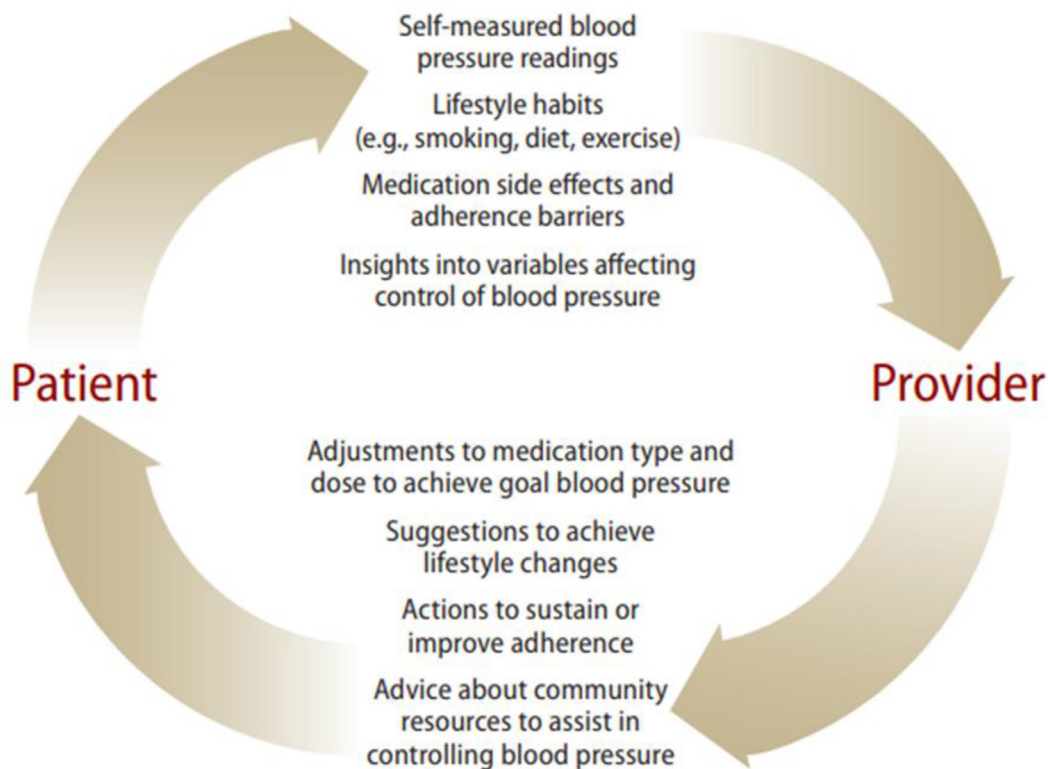
Fig. 1. Feedback loop between patients and healthcare providers supporting SMBP [36].

In addition, mobile health services may become a preferred method of HTN management during and post the COVID-19 pandemic, particularly in poorer populations with less health care access. Mobile health interventions for HTN usually involve the use of a patient's mobile phone, along with a validated BP measuring device, to track and communicate measurements with providers. A recent meta-analysis of eleven randomized controlled trials (4271 participants) associated significantly lower systolic and diastolic BP measurements with the use of mobile health interventions in patients with HTN [42]. These findings were consistent through study duration and treatment intervention intensity within the trials. Further investigations, involving nonpharmacologic interventions and modes of patient engagement, may increase the effectiveness of future mobile and telehealth BP interventions.