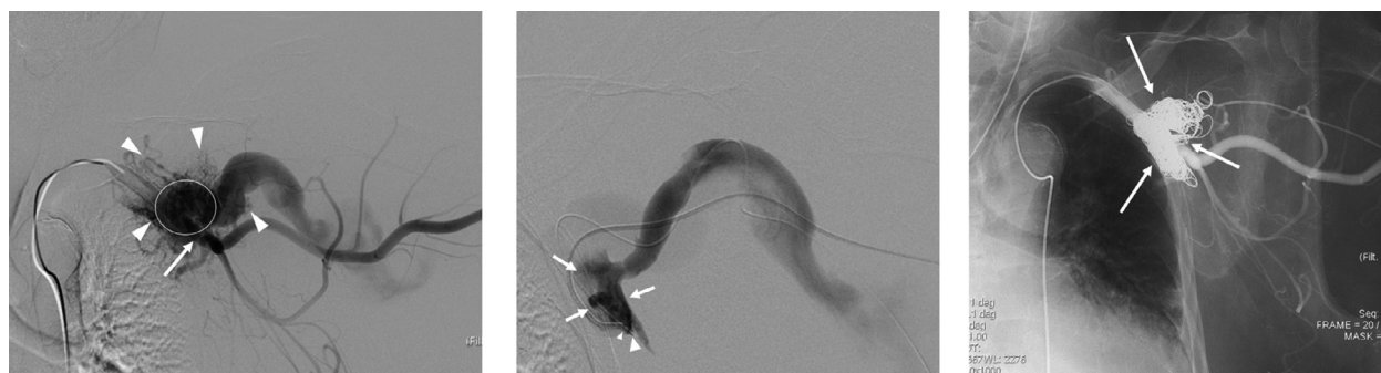
Fig. 2 – (A) DSA from the subclavian artery. Multiple feeding arteries (arrowhead) are visualized. Circle: initial venous sac. Arrow: subclavian artery. (B) DSA from the diagnostic catheter inserted from a drainage vein. The tips of the diagnostic catheter (small arrowhead) and a microcatheter (large arrowhead) are located in the initial venous sac (arrow). (C) Angiography after embolization of the initial venous sac. The initial venous sac is embolized using coils (arrow), glue, and alcohol. Multiple feeding arteries have completely disappeared.

responded with a type II AVM according to the angiographic classification [4].