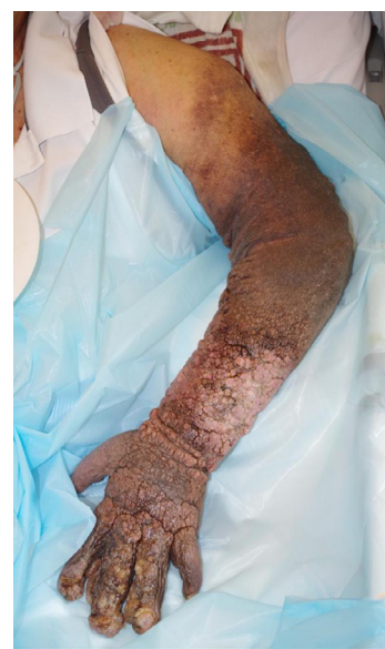
Fig. 3 – Photograph of the left arm (7 days after treatment). Edema of the left arm has improved remarkably.

Though AVMs are commonly believed to be congenital lesions arising from aberrant vascular development during the intrauterine period, secondary AVMs following chronic venous