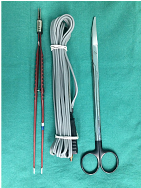
Figure 1 Tissue scissors and bipolar electrocoagulator used in the snip-electrocoagulation technique for liver resection.

The clamp-crushing technique (CCT), which was introduced in the 1970s, has become the most popular technique for parenchymal transection for its availability and simplicity in bleeding control, and it has been accepted as the gold standard technique for parenchyma transection in liver resection (13-15). One meta-analysis revealed that the CCT had faster dissecting speed, less intraoperative bleeding, and a similar rate of morbidity when compared with other transection techniques such as the hydrojet and radiofrequency dissection sealer, and the cavitron ultrasonic surgical aspirator (CUSA) (16). However, in recent clinical practice, we found that the liver parenchyma could be dissected quickly using tissue scissors and bipolar electrocoagulator, and this method led to clearer exposure of the intrahepatic vascular and biliary structures and less intraoperative hemorrhage than the CCT. We named this sharp dissection method the “snip-electrocoagulation technique” (SET). Here, we introduce this novel technique in detail and evaluate its safety and effectiveness in comparison to CCT for parenchyma transection in liver resection. We present the following article in accordance with the STROBE reporting checklist (available at http://dx.doi.org/10.21037/atm-20-3019 ).