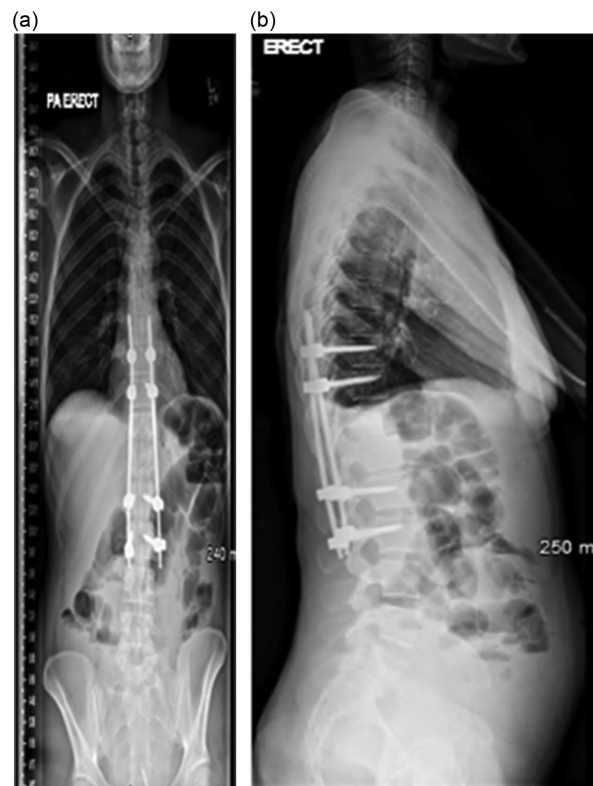
Fig. 2. (a) Anteroposterior radiograph of the whole spine. (b) lateral radiograph of the whole spine. Stabilisation with screws and rods can clearly be seen from T10 to L3.

The CT-guided pus sample received a Gram stain, which showed no organisms and few white blood cells. CT-guided and intraoperative samples were processed using glass Ballyotini bead homogenisation with inoculation onto blood agar aerobically, chocolate agar in 5% \text{CO}_2 and fastidious horse blood agar anaerobically (in anaerobic jars), all at