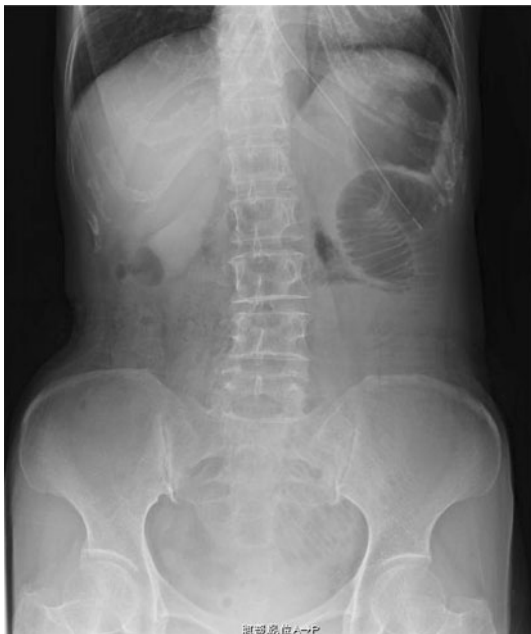
Fig. 1 Plain abdominal radiograph. The air-fluid levels in the left upper quadrant

the minilaparotomy was completed, the anastomosis and mesenteric defect were checked laparoscopically and found to be normal without any internal hernias. The tumor was diagnosed pathologically as a T2, N0, M0, stage I (TNM classification) adenocarcinoma. The patient showed no signs of recurrence following the operation. Three years and 6 months after the operation, the patient developed a bowel obstruction. She had nausea, vomiting and abdominal distension. A plain abdominal X-ray revealed the air-fluid levels in the left upper quadrant (Fig. 1). Computed tomography revealed caliber changes in the ileum (Fig. 2). This finding was initially thought to be compatible with a