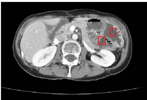
Fig. 2 Abdominal computed tomography. Caliber changes are seen in the small bowel. A stomach; B ileum

diagnosis of adhesive small bowel obstruction. Tapering of the ileum was seen under the navel. Because decompression with a long intestinal tube failed to resolve the bowel obstruction, surgery was thus performed.