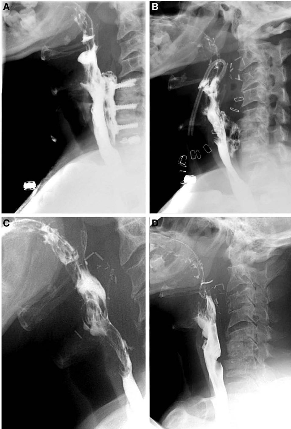
Fig. 3. Oral contrast swallow study depicting a posterior esophageal perforation after C5-7 anterior fusion (A). Seven days after omental flap reconstruction, a large leak contained within the omental soft-tissue envelope is observed (B). The contained leak dramatically shrunk on the follow-up swallow by 3 weeks after surgery (C). By 5 weeks after omental transfer, the esophageal repair was judged healed, and the patient was allowed a regular diet (D).

of mobilization, and minimal donor site morbidity as advantages compared with other tissue flaps. 3,4,11,15-19 However, debate exists regarding the vascular reliability of the SCM muscle, especially the inferior pedicle, which is of particular concern in patients