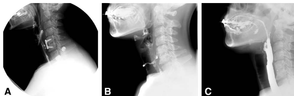
Fig. 2. Lateral preoperative and postoperative fluoroscopic imaging of a late presenting cervical esophageal perforation. A, Preoperative presentation demonstrating an esophageal leak and persistent fluid collection adjacent to the surgical hardware. B, Postoperative imaging attained 2 months after a radial forearm flap reconstruction with evidence of a persistent leak. C, Imaging attained 14 days after a second reconstructive operation using omentum. Definitive closure of the leak is noted.

was found to yield high rates of infectious complications and a 17% mortality rate in the largest review of all-cause esophageal perforations to date. 5 Comparatively, surgical intervention in addition to conservative measures reduced mortality to 12%, and as such, represents the gold standard. 3,5,14,23