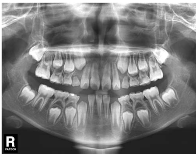
Fig. 6. The highest scored image of the 'poor, but diagnosable' image quality group.

of 100. Considering that 75% of the reference dose was used, the score would be 88, and thus, 88 points can be recommended.