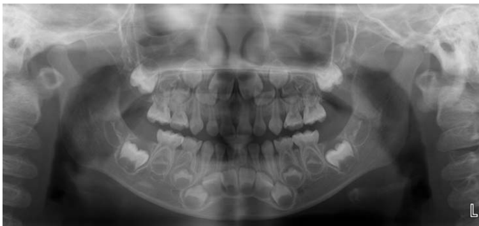
Fig. 1. An example of the image from 'optimal for obtaining diagnosis information' group.