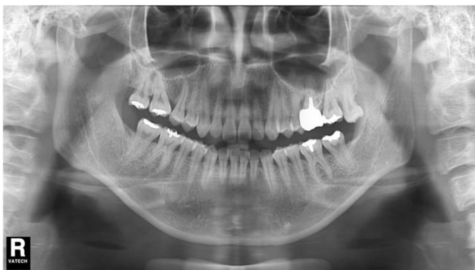
Fig. 2. An example of the image from 'adequate for diagnosis' group.