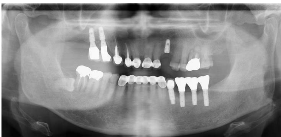
Fig. 3. An example of the image from 'poor, but diagnosable' group.

errors in the positioning, such as the patient positioning, patient movement, and angle of the cervical spine; 135 errors in the processing such as an abnormal density, contrast, and resolution; 50 errors from the radiographic unit