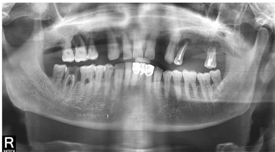
Fig. 4. An example of the images from 'unrecognizable, too poor for diagnosis' group.