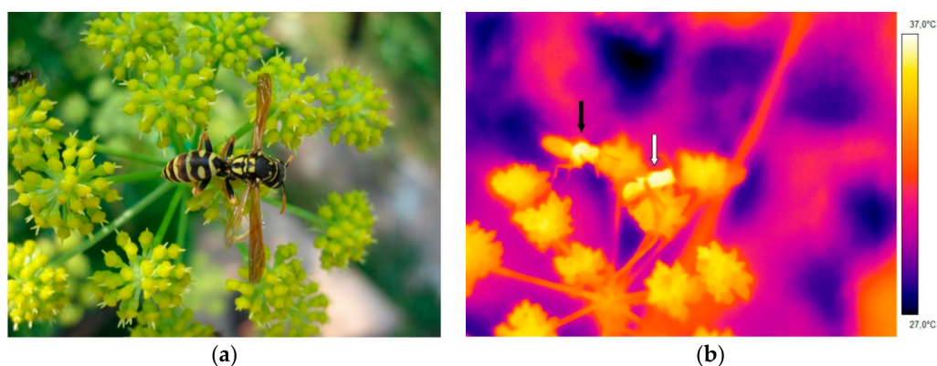
Figure 1. (a) Dead wasp ( Polistes dominula ) attached to an inflorescence of lovage for measuring the operative temperature ( T_e ). (b) Thermogram of a living wasp (left, black arrow) foraging on lovage and a dead wasp (right, white arrow), measured at an ambient temperature of 30 °C.

To take into consideration the effects of ambient air temperature, solar radiation, and air convection of the measurement site on the wasps' body temperature, we determined the insects' thermal environment, expressed in terms of the operative (environmental) temperature ( T_e ). The operative temperature is the temperature of an object with the same external (e.g., size, shape, and color) and internal characteristics as the animal under consideration; it integrates convective and radiative heat transfer between the environment and the animal [1,15–18]. The use of fresh insect carcasses is highly recommended in such studies, because they represent the passive reaction to environmental conditions much better than dried specimens [1,19]. In our study, a dead wasp was used as an operative temperature thermometer. For this purpose, a wasp was caught and killed by freezing. The defrosted wasp was attached to the center of the flowers' inflorescence in a natural foraging position, as shown in Figure 1a. The body surface temperature of the dead wasp was measured by infrared thermography (see above) and the ambient temperature ( T_a ) was measured 1 cm beside the wasp, as shown in Figure 1b. The dead wasp was measured simultaneously or in alternation with the living foraging wasps. With this model, we were able to quantify the part of temperature increase generated by endothermic heat production of the living wasps.