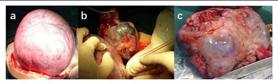
Fig. 2 Macroscopic appearance of the uterus, the left ovary tumor during the first surgery. The middle trimester uterus was in normal size (a). The largest mass was on the left ovary behind the uterus whose surface was seriously crispy (b). Complete resection of tumor without rupture was performed (c)

Xu et al. Journal of Ovarian Research (2019) 12:108 Page 3 of 6