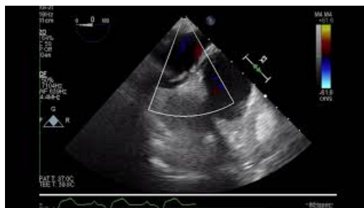
VIDEO 1: TEE upper esophageal bicaval view showing a mildly enlarged right atrium and a PFO.

However, hypoxemia out of proportion to the degree of pulmonary embolism and examination findings consistent with orthodeoxia (reproducible drop in oxygen saturation from 92%-93% to 82%-83% after changing from recumbent to an upright position) prompted a further workup. The nuclear medicine ventilation-perfusion (V/Q) scan was consistent with a mild right-to-left shunt (5.9%). Transesophageal echocardiography (TEE) revealed a mildly enlarged right atrium and a PFO, with a maximum opening of 3.5 mm and a tunnel length of 25 mm (Videos 1, 2). On right heart catheterization, right-to-left shunt (QP/QS) was calculated at 0.74 with normal right heart pressures. The patient underwent PFO closure with a transcatheter 30-mm Gore device (GORE® CARDIOFORM, Arizona, USA), resulting in the immediate resolution of hypoxemia.