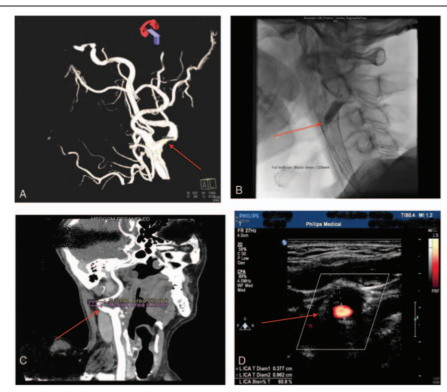
Figure 1. An example of left-sided severe internal carotid artery stenosis undergoing carotid stenting treatment. A 67-year-old male patient manifested with rightsided hemiparesis and dysarthria, 24 hours before admission to our neurology ward. (A) Reconstruction imaging of digital subtraction angiography showed a short segmental high-grade stenosis (>70%) involving the proximal part of left internal carotid artery. (B) The insertion of E-Z wire to prevent distal emboli migration. After the stent was placed, a 6 × 20 mm balloon catheter was used for postdilation purpose. (C) The computed tomographic angiography (CTA) showed evidence of segmental stenosis at left cervical internal carotid artery, severe degree (64% based on area measurement). (D) B-mode imaging of cervical color-coded carotid duplex showed 60.8% stenosis detected by the cross-sectional maneuver.

2.3.2. DSA and stenting. The stenting procedure is illustrated in Fig. 1. Biplanar intra-arterial DSA was performed using a