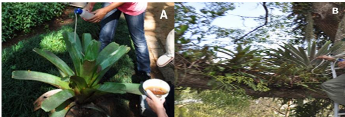
Fig. 2. Collection of immature mosquitoes in leaf axils of bromeliads using suction samplers in urban parks in the city of São Paulo, Brazil, between October 2010 and July 2013. (A) Terrestrial bromeliad, (B) Epiphytic bromeliad