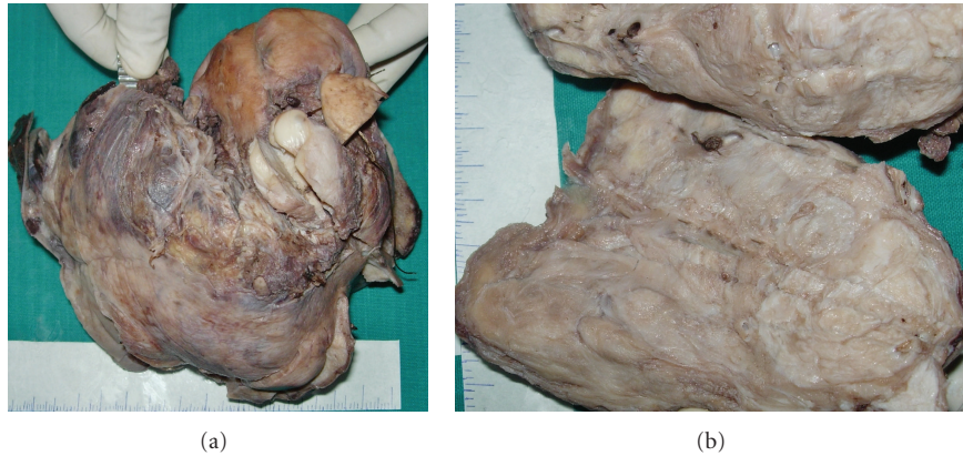
FIGURE 1: (a) Gross photograph showing a large hemorrhagic mass arising from the uterus. (b) Cut section of the tumor showing whitish whorled areas with interspersed blood vessels.