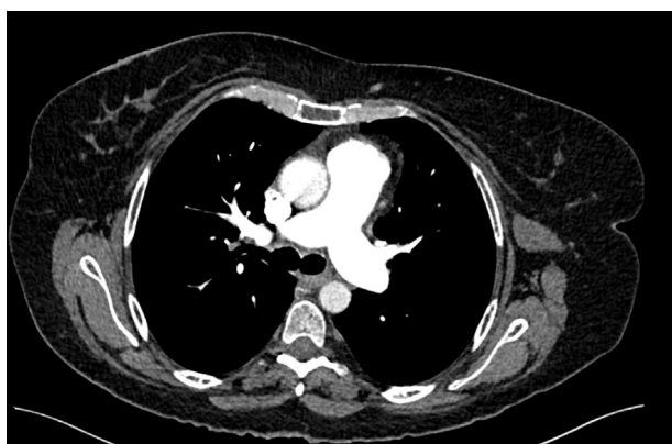
Fig. 2. HRCT of the chest showing PA/aorta ratio > 1.

pulmonary hypertension without a left heart failure component; lung parenchymal involvement was considered not to contribute to PH. The treatment algorithm for group 1 PH in the Nice classification was applied. The patient was classified in the intermediate-risk group. Treatment with a phosphodiesterase type 5 inhibitor (PDE5i) (tadalafil) in association with general measures and supportive therapy (diuretics and oral anticoagulation) was initiated. At 3 months follow-up, the patient was still in NYHA functional class III, but no longer had signs of right heart failure. 6MWD had increased to 470 m, BNP was <10 pg/mL. Peak VO_2 was 18 ml/min/