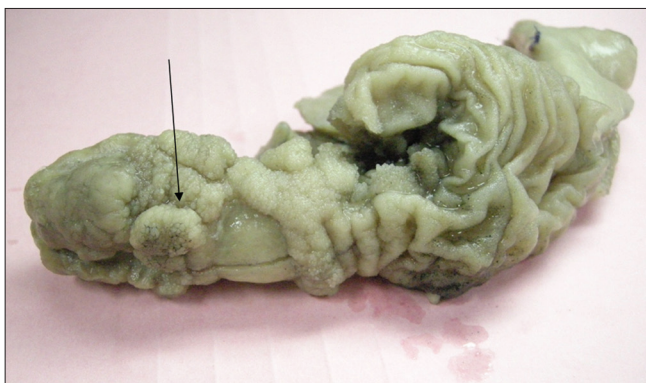
Figure 3: The resected ileum specimen shows inflammatory pseudo polyps (black arrow)