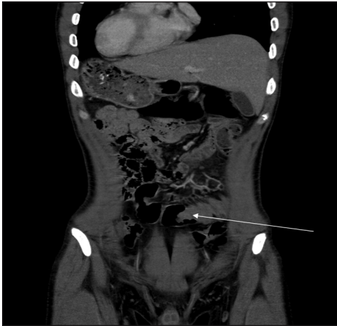
Figure 1: Contrast-enhanced CT scan of the abdomen demonstrated situs inversus totalis with apex of the heart, stomach and spleen resting on the right side and the liver on the left side of the abdomen and ileocolic intussusception which creates characteristic bowel-within-bowel appearance, seen in left iliac fossa (white arrow)

evidence of proximal bowel obstruction was noted. Patient underwent an exploratory laparotomy and operative findings were ileoileal and ileocolic intussusception, through cecum up to transverse colon. There was no evidence of bowel ischemia. Retrograde reduction and segmental resection of ileum 12 cm from ileocecal junction was done which contained a polypoidal mass. Anatomical side-to-side but functionally end to end anastomosis was performed with mechanical GIA-75 single use stapler with absorbable staples. Appendicectomy was performed as well. The gross specimen showed inflammatory pseudo polyps [Figure 3]. Histopathology showed a small intestinal tissue exhibiting numerous inflammatory pseudopolyps projecting above the mucosal surface composed almost entirely of inflamed granulation tissue with surface ulceration. Crypts are dilated and hyperplastic [Figure 4]. The postoperative period was uneventful. After 3 months of follow up patient is fine and has no bowel symptoms till date.