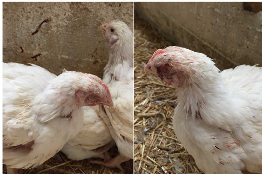
Figure 1. A 33-day-old broiler chicken with typical symptoms of ILT. In particular, bloody mucoid ocular exudate which soiled both the plumage ( right ) and the walls of the poultry house ( left ).

At 25 days of age, numerous broilers displayed respiratory symptoms; signs of dyspnea, rales, gasping, and expectoration of bloody mucus, along with depression and anorexia. Birds had developed conjunctivitis with ocular secretion, nasal discharge, and swelling of the infraorbital sinuses, as depicted in Figure 1. The farmer's concern arose from the fact that dead birds numbered approximately 100 to 150 per day, and a rising proportion of the birds expressed anorexia and stunted growth. During the same period, neighboring broiler and breeder flocks in the area reported the appearance of respiratory infection with a similar clinical display.