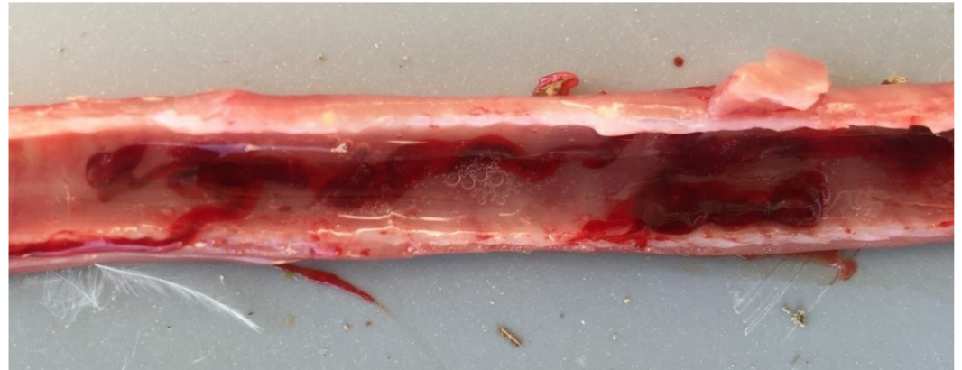
Figure 2. The trachea of a 33-day-old broiler chicken with typical symptoms of ILT, where hemorrhage and congestion of the trachea are visible, accompanied by bloody mucoid exudate in the lumen.

the upper respiratory tract. Gross lesions included mucoid inflammation of the trachea and larynx, while in more than half of the birds, a mild to severe degree of hemorrhages, excess mucous, and blood casts were present inside the lumen of the trachea, such as the trachea appearing in Figure 2. Moreover, edema and congestion of the epithelium of the conjunctiva and the infraorbital sinuses were apparent, accompanying hemorrhage of the larynx.