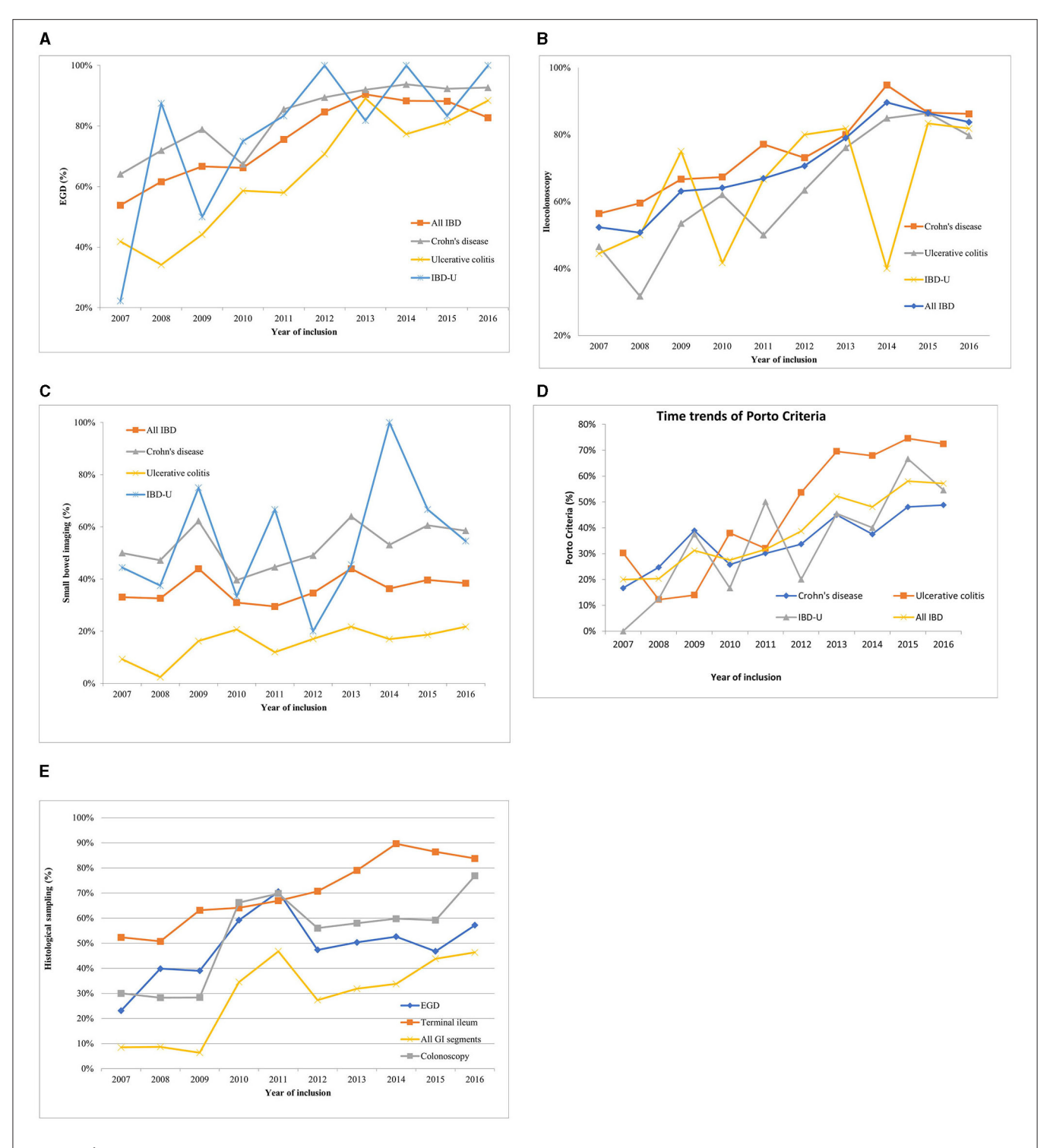
FIGURE 1 | Time trends of diagnostic procedures within the HUPIR cohort from 2007 to 2016. (A) Time trends of esophagogastroduodenoscopy in ulcerative colitis, Crohn's disease and IBD-U between 2007 and 2016. (B) Time trends of ileocolonoscopy in ulcerative colitis, Crohn's disease and IBD-U between 2007 and 2016. (C) Time trends of adequate small bowel imaging in ulcerative colitis, Crohn's disease and IBD-U between 2007 and 2016. (D) Time trends of completed Porto criteria in ulcerative colitis, Crohn's disease and IBD-U between 2007 and 2016. (E) Time trends of histology sampling in paediatric inflammatory bowel disease between 2007 and 2016.

Müller et al. Adherence to Porto Criteria in pIBD