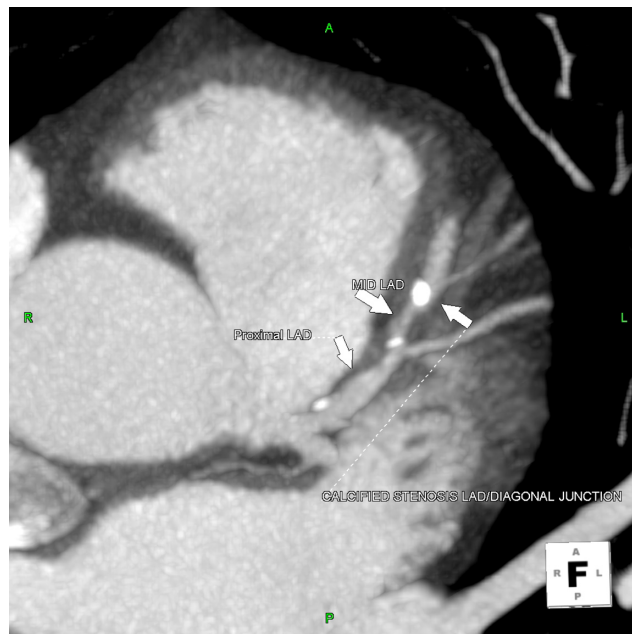
Figure 2 Illustration of soft and calcified plaque in proximal and mid LAD.

More than 50% of ER admissions to the hospital are for observation to collect preliminary data to exclude ACS, PE, and AD. Unfortunately, positive yield of this large number