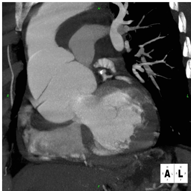
Figure 3 Patient presenting with acute chest pain; CCTA image showing large aortic root dissection.

The crucial role of CCTA for evaluation of chest pain and early triage of patients in the ER is evolving very fast. The feature of three dimensional volumetric acquisitions virtually allows unlimited views for image projection after processing. There has been intense interest in ‘triple rule out’ protocol for chest pain by a single acquisition that results in simultaneous opacification of coronary arteries, aorta, and arterial phase opacification of pulmonary arteries. This examination may need 110 cc of contrast, a specialized post-processing with routine reconstruction for coronaries, wide field of view (FOV) coronal reconstruction of lungs, and oblique sagittal reconstruction for thoracic aorta. The major disadvantage of ‘triple rule out’ protocol is an increase in the radiation dose due to the large area of coverage and an increase in contrast use. CCTA has the advantage of faster acquisition in a single breath hold with excellent imaging resolution.