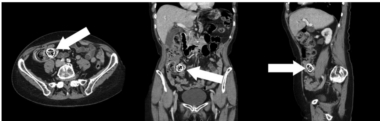
Figure 2: Axial, coronal and sagittal CT views showing a giant appendicolith within the base of the appendix. Calcification and the laminar structure are well demonstrated on CT.