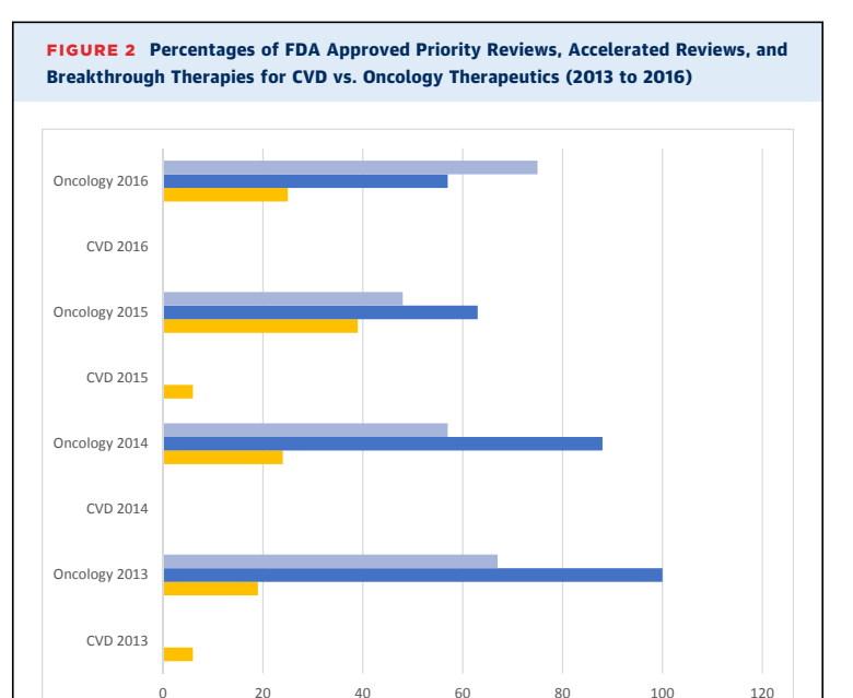
CVD therapeutics received approvals (priority reviews) in only 2 of the 4 years, and in none of the 4 years did CVD therapeutics receive accelerated review or breakthrough therapy designations.

RISK ACCEPTANCE AND THRESHOLD. Ultimately, drug approvals occur within an acknowledged benefit/risk balance, and the acceptable threshold for this balance above which a drug license is approved and below which it is denied cannot usually be described by a single metric-and varies highly from drug to drug. Regulators and the public are both more willing to accept a higher level of benefit/risk uncertainty for life-threatening or severe conditions with an unmet medical need compared to less severe conditions. For example, the FDA approved bedaquiline, for drug-resistant tuberculosis (TB) on the basis of only 2 studies involving a total of about 200 patients. Studies showed that bedaquiline improved clearance of TB from patient sputum, but they also