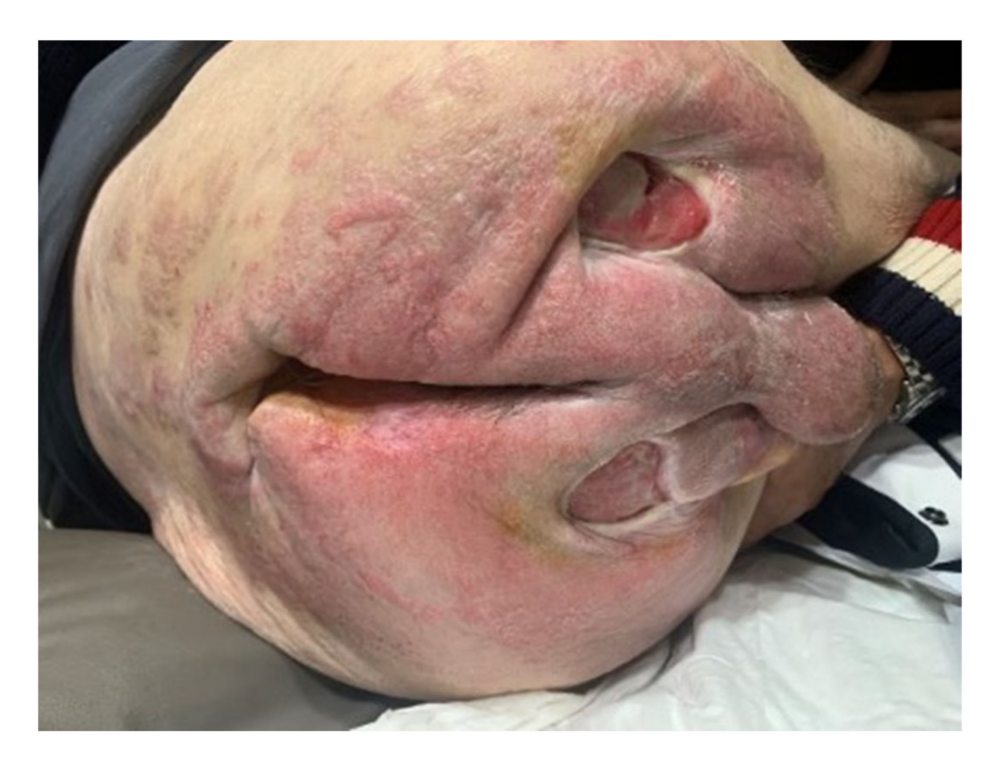
Figure 2. Situation Status one year after discharge from the hospital.