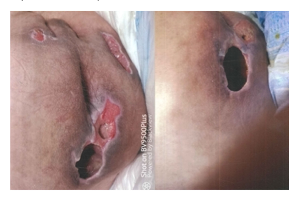
Figure 1. Situation at hospital discharge.