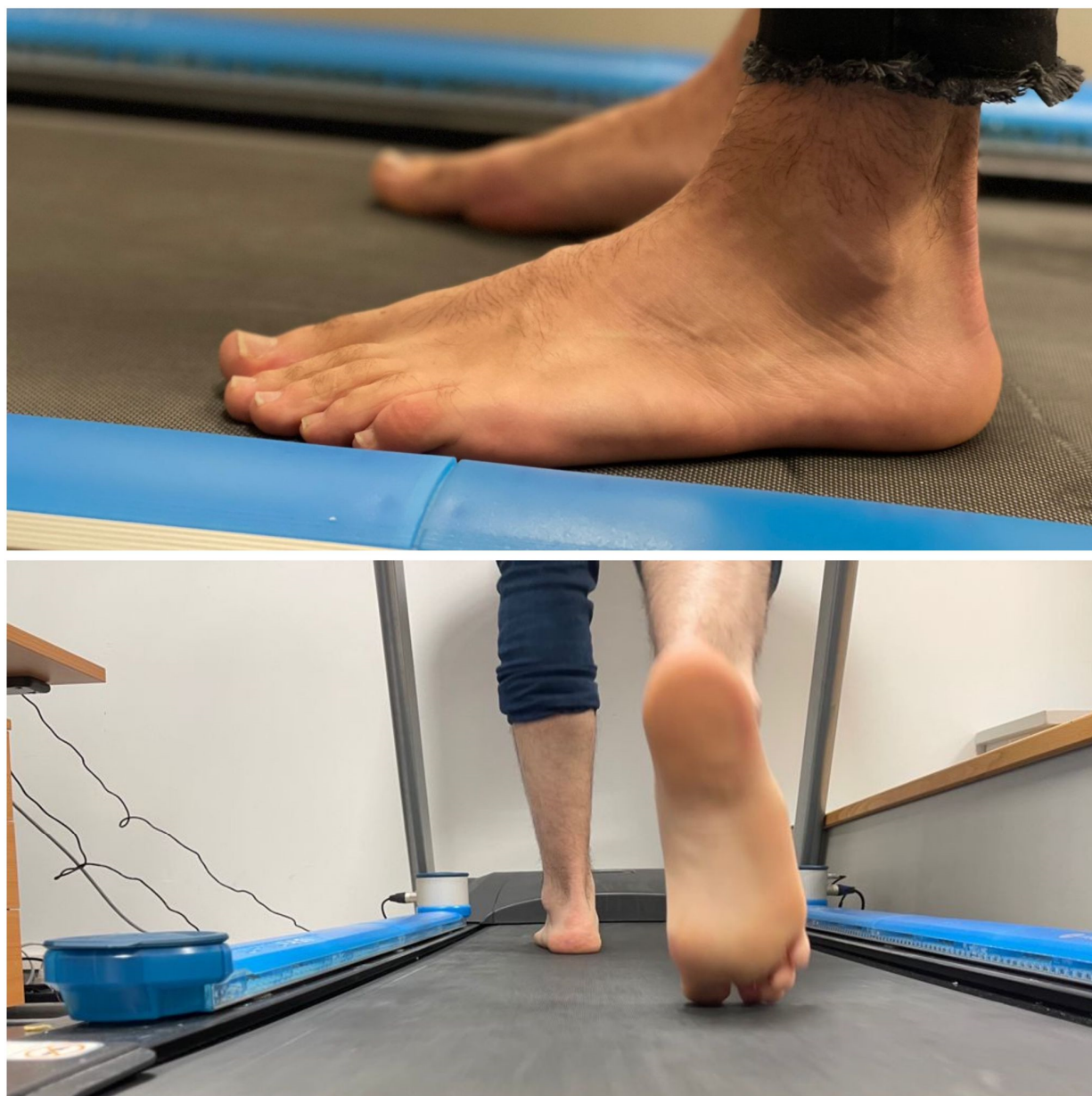
Figure 2. OptoGait treadmill gait analysis.

A couple of one-meter photocell systems were placed next to the treadmill at a speed of 4 km per hour, and previously, the size of the subject's bare foot was recorded. The results obtained through this system are commonly used to correct asymmetry in gait parameters by using custom plantar supports.