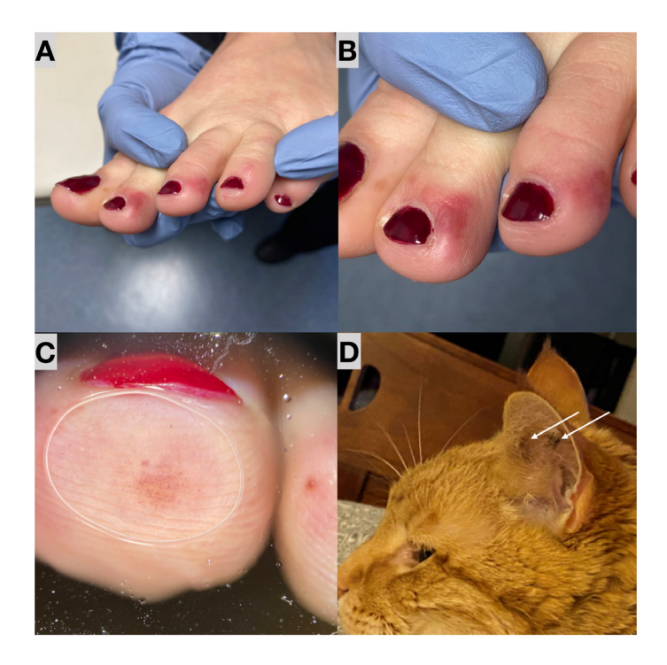
Figure 1. Initial presentation of patient and her pet cat. (A) Clinical images taken of the patient's left foot, showing multiple well circumscribed violaceous discolorations with surrounding pink erythema on the distal toes. (B) Closeup of the chilblains-like lesions. (C) Dermoscopy image of the fourth toe showing multiple red globules. (D) Patient-submitted clinical photos of her indoor pet cat with multiple red-purple well-circumscribed slightly raised spots bilaterally that also resolved spontaneously. Additionally, ocular discharge was present.