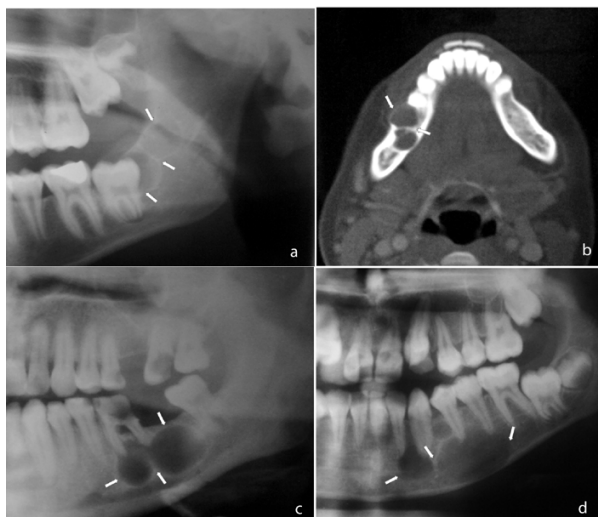
Fig. 3. Multilocular cyst: cyst with internal structure that was predominantly radiolucent and divided into more than one cavity with thin septa (s).

Z-test was used to determine differences in cyst numbers between males and females and to determine differences in cyst location in males and females. Chi-square tests were used to assess the statistical significance of differences between gender groups in the frequency distribution of categorical variables. All computational work was performed using Minitab (Minitab V. 13.20, 2000).