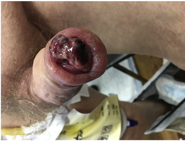
Figure 1. The image depicts the patient's indurated penis with a bleeding and fungating mass protruding through the urethral meatus.

Subsequent pathology report demonstrated poorly differentiated malignant neoplasm that stained negative for PSA and PSAP. Within 4 months, and despite a PSA of 0.14, the patient presented to the emergency room with a friable bleeding mass growing through the urethral meatus. Physical exam revealed severe induration of the penis and pubic region. Local wound care was applied with gauze dressings. Further treatment options were discussed with the patient and his family, but they have decided on comfort