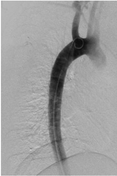
Fig. 3 Intraoperative aortography demonstrates no extravasation of contrast and normal filling of the descending thoracic aorta.